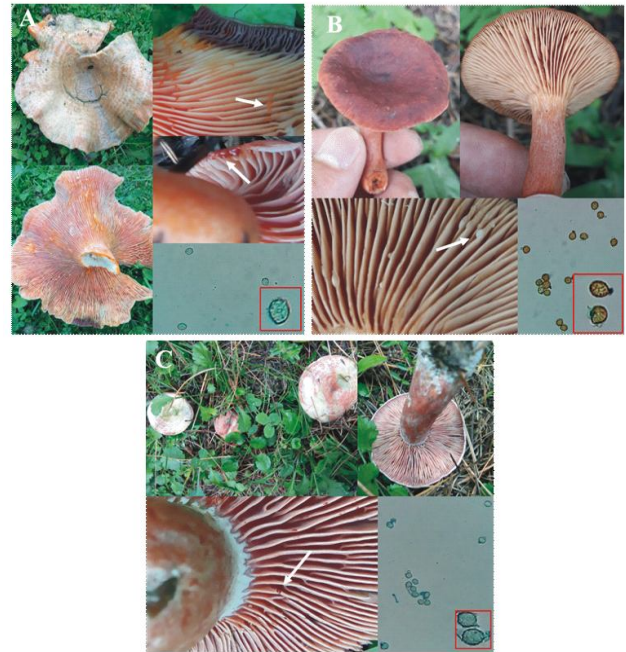
Fig.3:(A-C). Fruiting body and basidiospores of Lactarius species with different latex color. A. Lactarius deterrimus ; B. L. rufus ; C. L. sanguifluus .