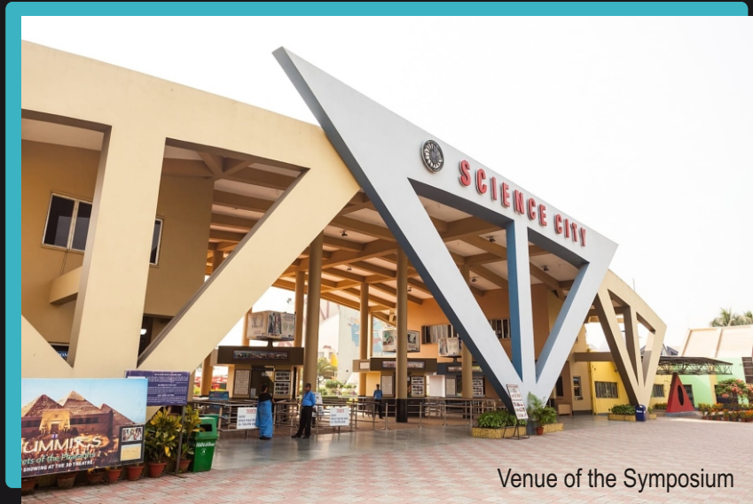
Venue of the Symposium